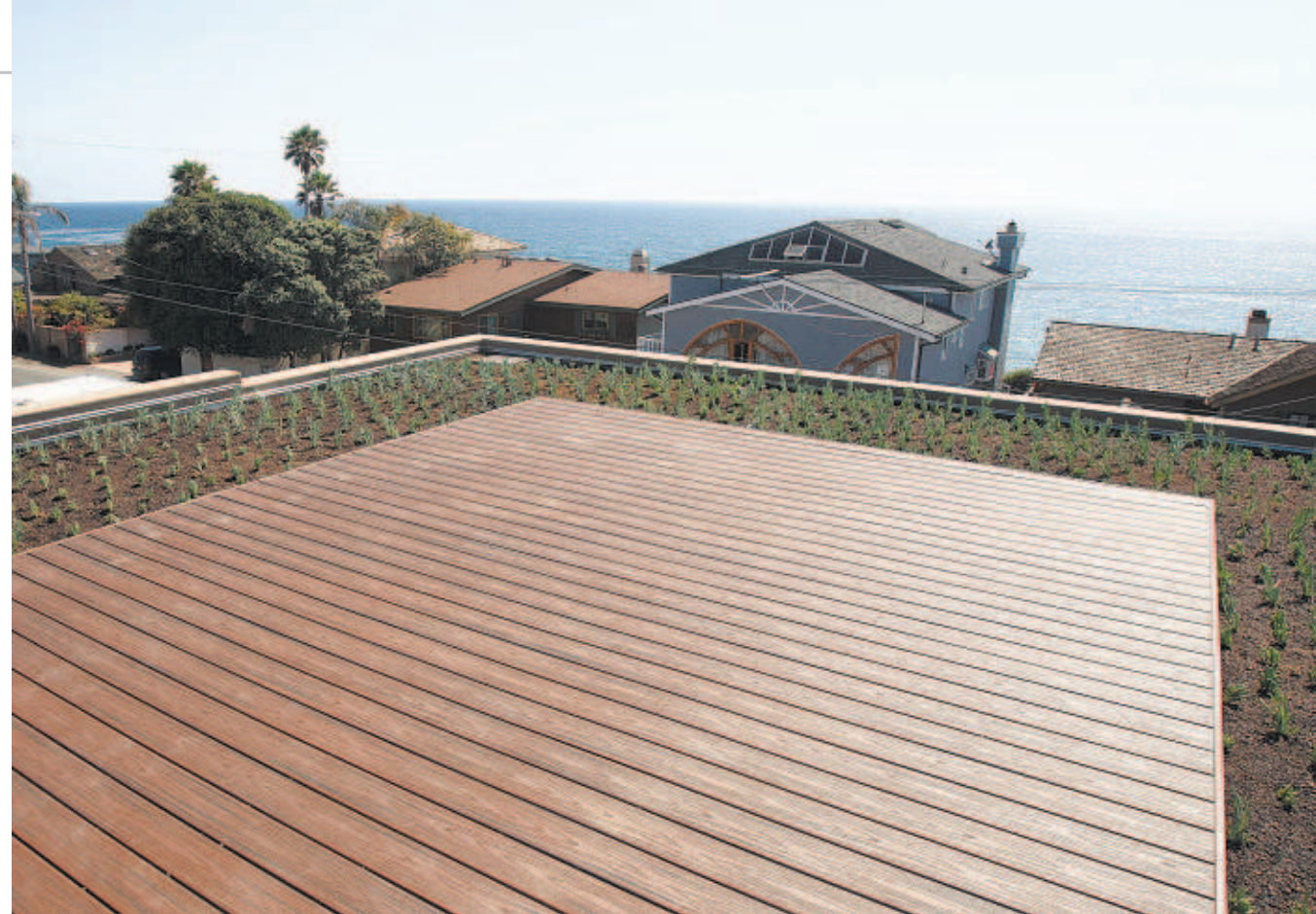
The rooftop deck of Neptune Norte (above) is right in the middle of the nexus of green buildings on Neptune Avenue in the Leucadia section of Encinitas. The city is encouraging more LEED projects like these by offering priority plan checks and financial incentives.

The three-bedroom, three-and-a-half-bathroom home, which is for sale, has a