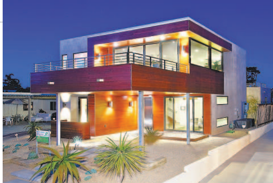
The drought-tolerant landscaping and entry stairs of "ArtHaus2" are designed to direct storm water to infiltration basins, which reduces storm-water runoff to the nearby Pacific Ocean.

The style of the custom Platinum home that Adams plans to build on the adjoining lot next year is quite different. North